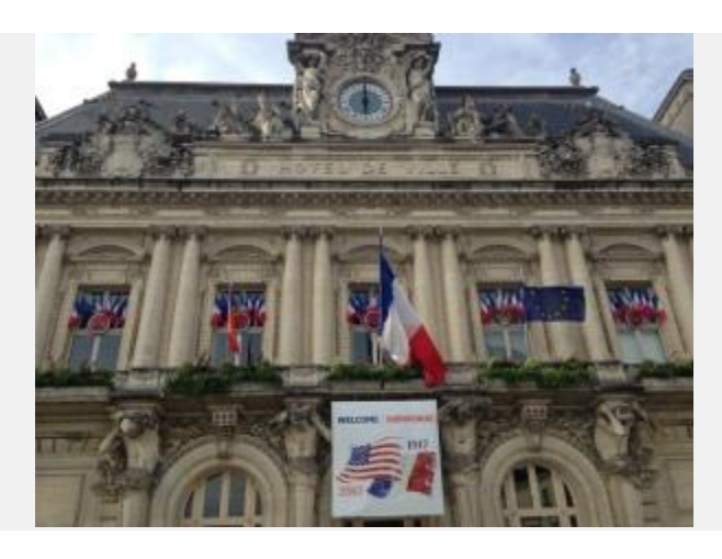
The city hall of Tours, an official polling place for their presidential election

As the city hall served as an official poling place for their presidential election, we were granted special access to observe their election day process. Leading up to the vote, residents were noticeably nervous about the outcome, with one remarking to me, "Well, we're all just praying for Sunday." On Sunday evening, we joined approximately 100 people in the main room at city hall where results were coming in on a big screen television. A cheer and audible sigh of relief went up as the crowd was made aware of the victory of Emmanuel Macron, the youngest man ever elected to the French presidency.