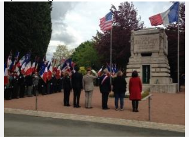
Members of the Minneapolis delegation joined French dignitaries in honoring those lost during World War I

At the Cimetiere la Salle, we inaugurated a memorial dedicated to the American