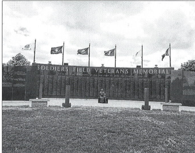
The Wall of Remembrance lists about 3,000 folks from southeastern Minnesota who died from injuries sustained in the military.

They stretch from the beginning of our country to