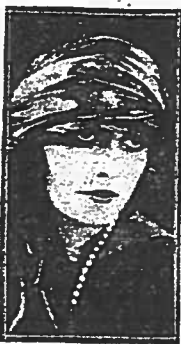
Pola Negri, American continental star, is seen in a scene from 'The American Girl'.