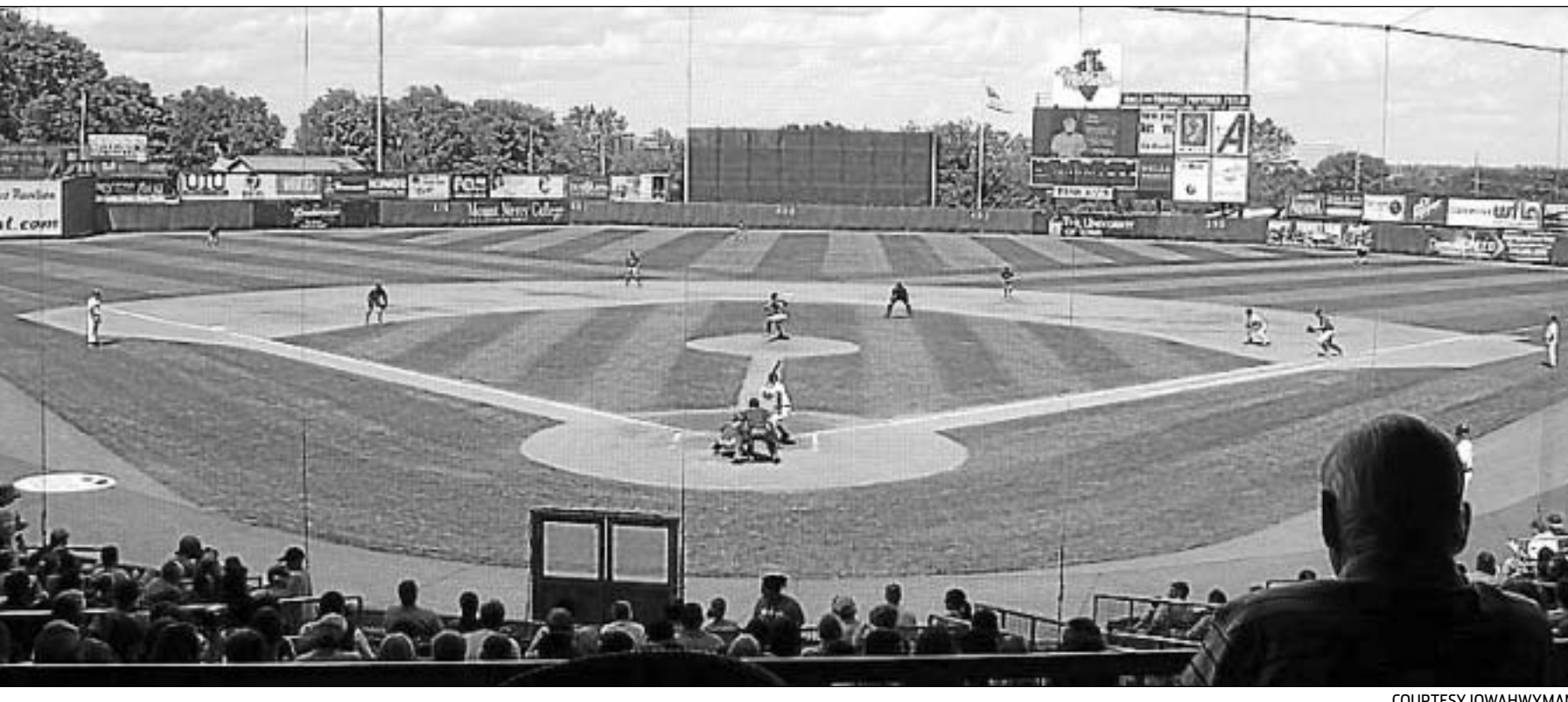
Veteran's Memorial Stadium in Cedar Rapids, Iowa, is home to the Cedar Rapid Kernels, the Twins Class A affiliate.